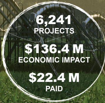
Tennessee Agricultural Enhancement Program