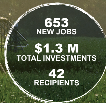
Agricultural Enterprise Fund